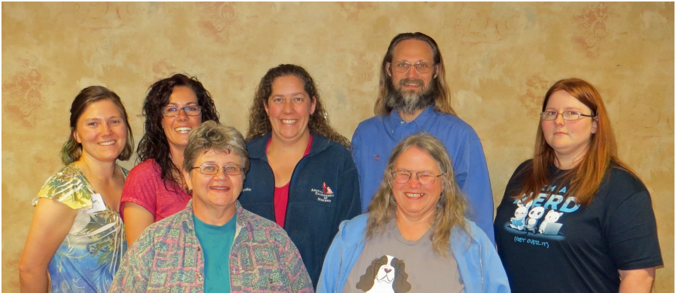
2016 Wyoming Veterinary Technician Association Executive Board: